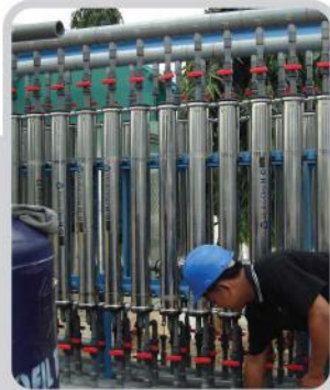
Wastewater recycling plant at unilever factory, Jakarta-Indonesia