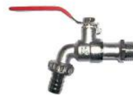
Manual water tap