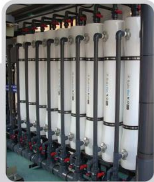
Containerized wastewater recycling plant shipped to Saudi Arabia