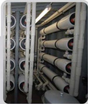
Laundry wastewater recycling plant installed at Brisbane - Australia