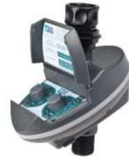
Battery operated auto timer controller

Flexible Installation ( Suitable for all landed property & condominium / apartment ) Installation can be horizontally or vertically wall mounted. No space constraints !