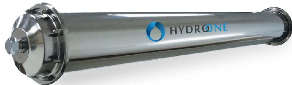
Fully Stainless Steel Casing Model H2O-Z2000

Recommended Replacement Membrane module: after 3-5 years