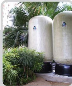
Centralised water filter for Bukit Utama condominium